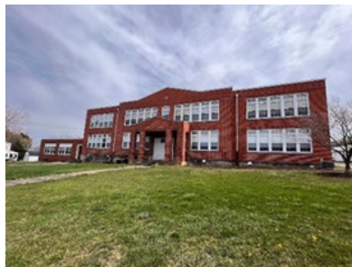
Caption: Front view and interior of the gymnasium at the New Market Community Center.

The town is seeking additional grant opportunities, including the Virginia Department of Environmental Quality's (VA DEQ) Brownfields Remediation Program, with plans to apply in Fall, 2025. If successful, these funds would be used to help with the removal (abatement) of lead paint and asbestos throughout the remaining areas of the first floor.