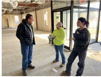
Caption: Inside the Press Building during a meeting with consultants conducting Environmental Site Assessments at 377 Industrial Park Rd.

Exciting progress updates on the New Market Community Center ! Following the initial work done as part of the Brownfields Assessment grant, the Town of New Market has applied for $50,000 of State funding to help remediate the cafeteria and dining area as part of the town's effort to create a commercial kitchen space. In support, the County has applied for State funding to help support a future tenant.