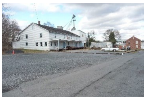
Caption: Side view of the King Street Property, 5379 King St., Mt. Jackson.

Want to see how we're making it happen? Check out the video of two properties ( 377 Industrial Park Rd., Mt. Jackson & 5379 King St., Mt. Jackson ) we're currently working with!